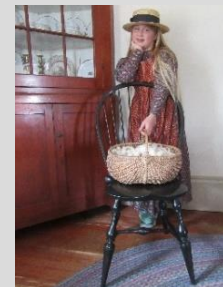
Windsor Chairs Four @ $500/each