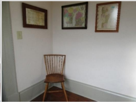
JC Office west and north walls