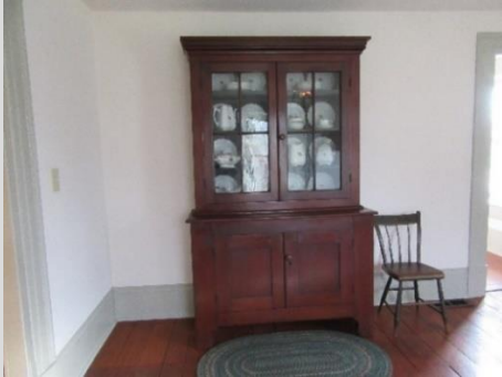
Parlour east wall