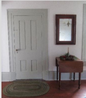
Parlour front door