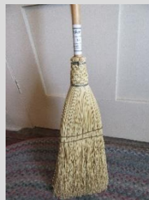
Hand-Made Corn Broom $50