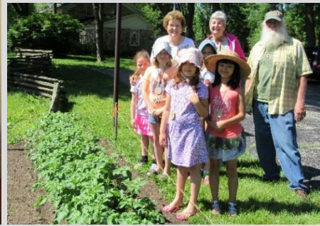
2016 and 2017 JCH Kid's Camp at the MT Recreation Department and at the JCH Museum