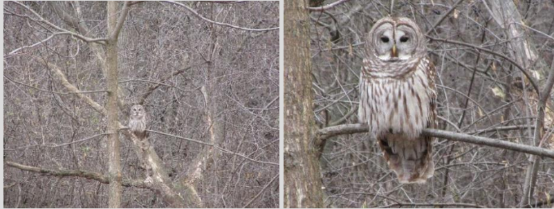
Jonathan Clark House Museum Woodland Photo - December 26, 2020